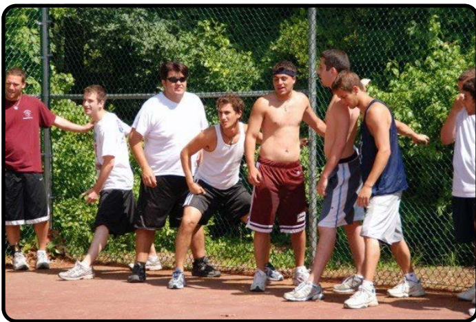
Characters from the 2007 Staff Bombardment (left to right):

I know I'm preaching to the choir here, but Avoda doesn't thrive without the exceptional collection of humans that hail from it. It's about the people: the Avoda greats / Avoda legends. There's too many to list. I think about the characters and personalities in my generation and the bonds created between them. I think about the awesome alumni whom I didn't know while at camp but whom I now call friends. We're a network of people who share something magical, who share a secret hidden gem.