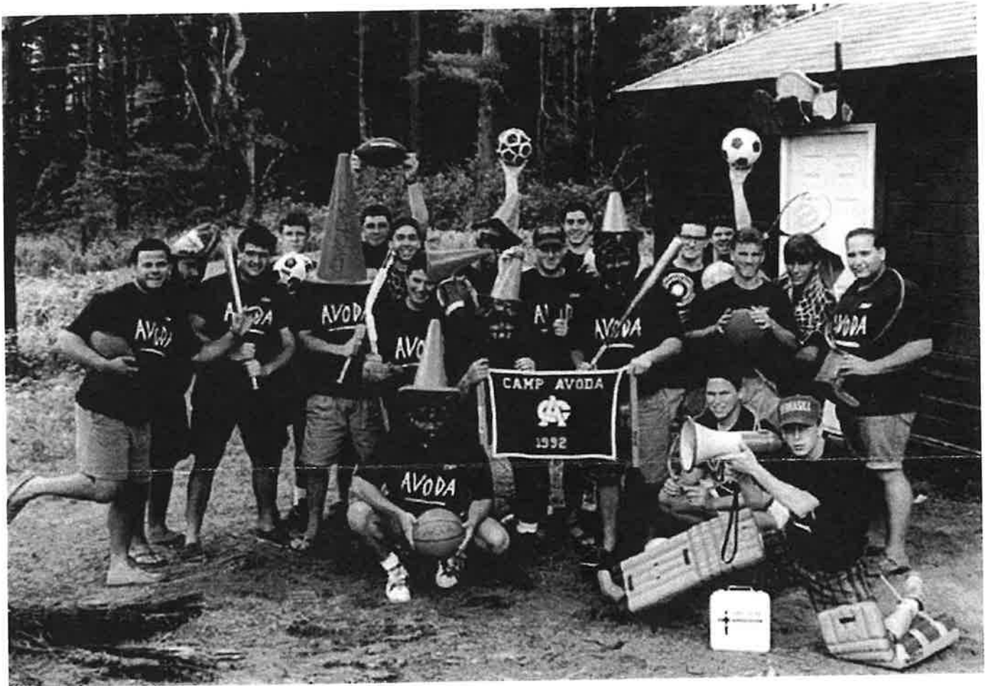
1992 Athletic Staff