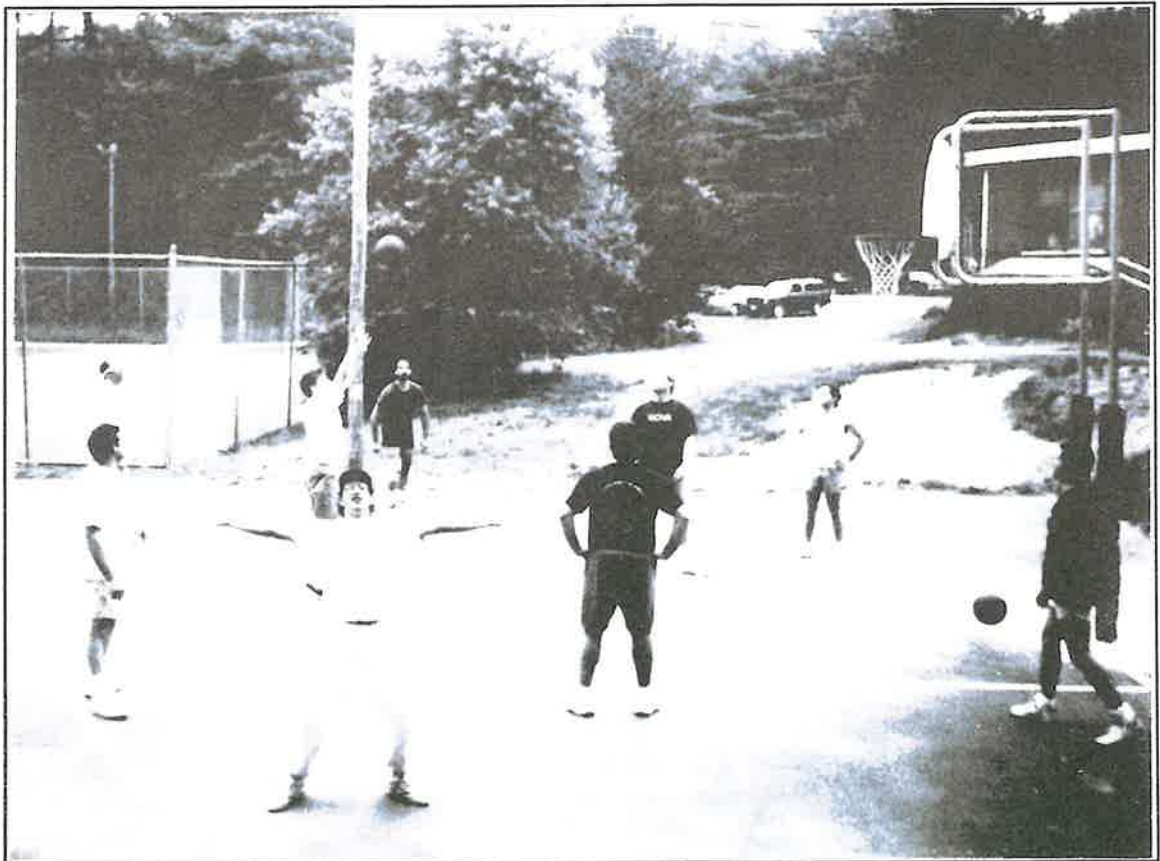
I love playing basketball at Avoda THIS much!