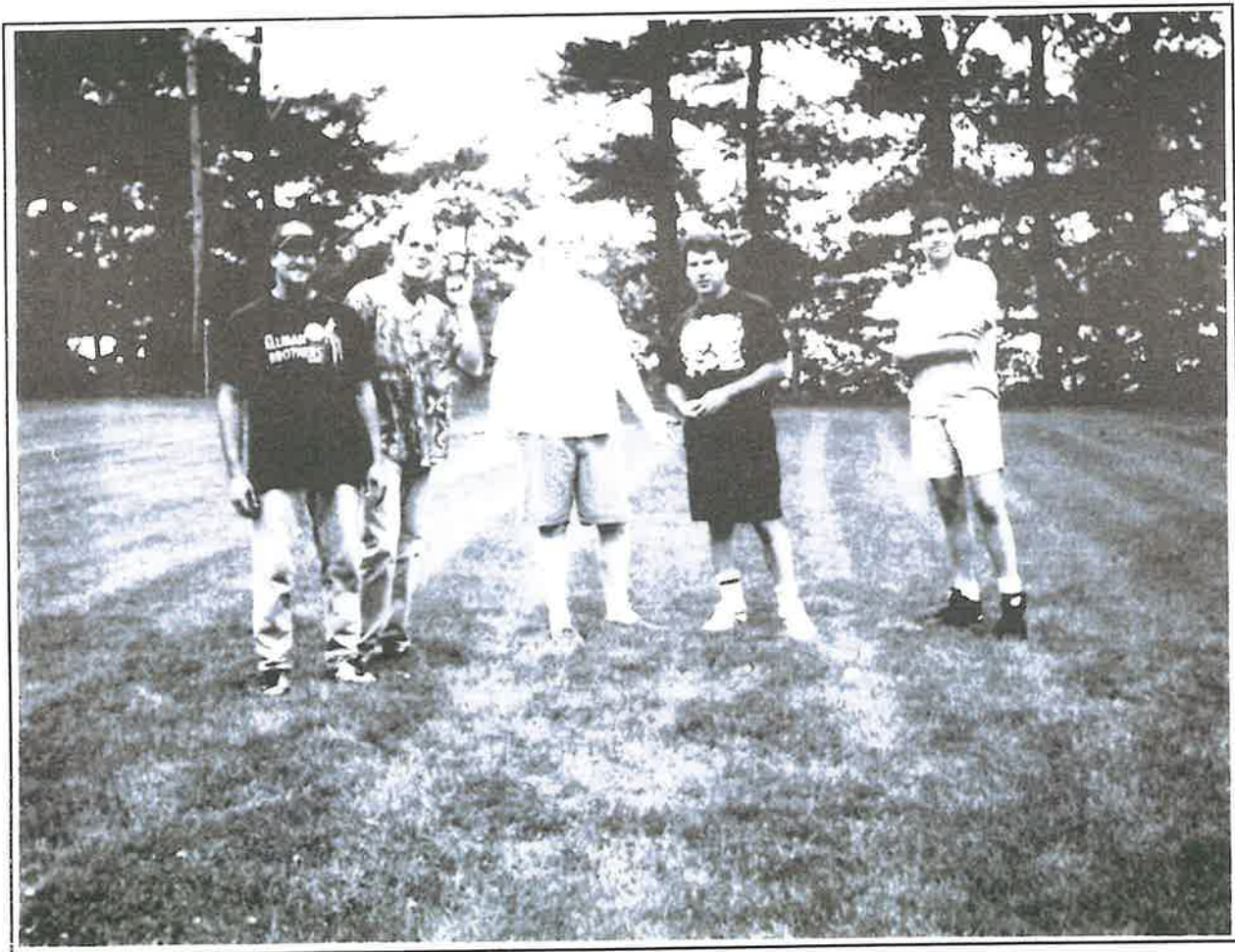
Five alumni, outstanding in their field.