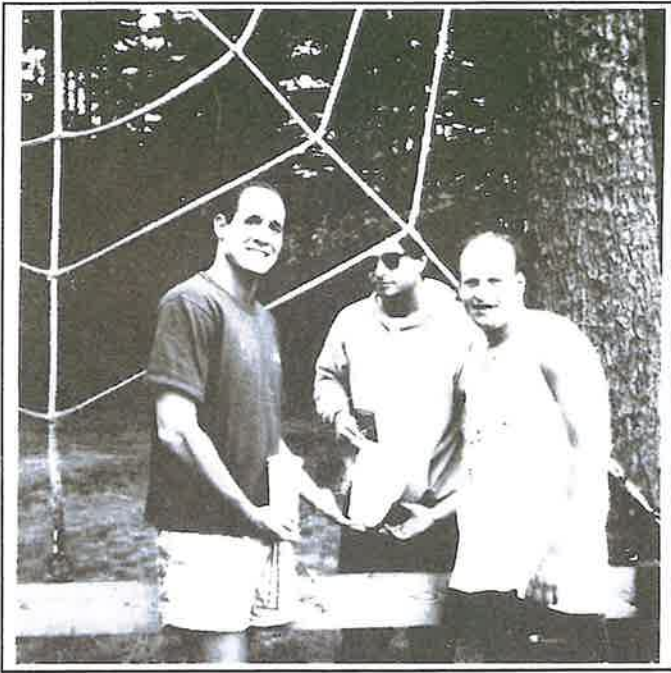
“Come into my web,” said the spider to the fly.