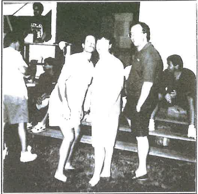
Shadoop shadooby doop, shadoop shadooby doop...