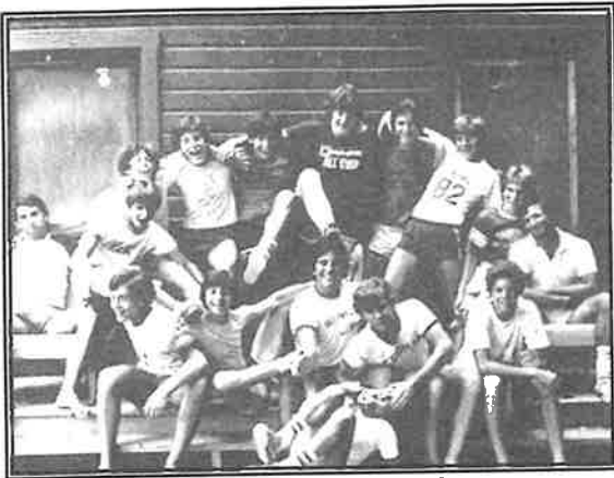
1979 Bunk 14 Then...