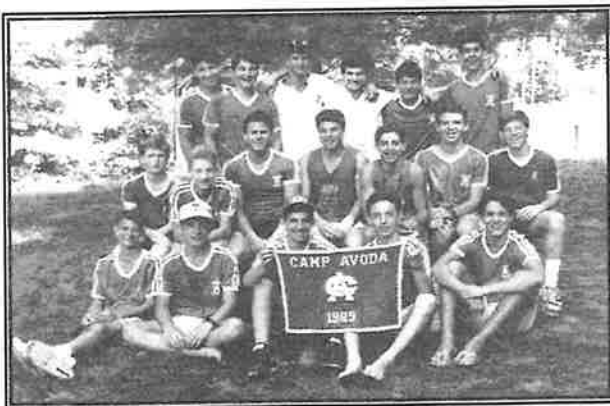
1989 Bunk 14 Then...