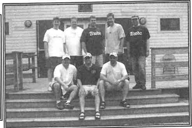
... And Now