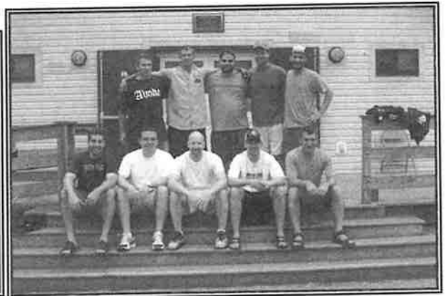
... And Now