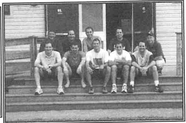
... And Now