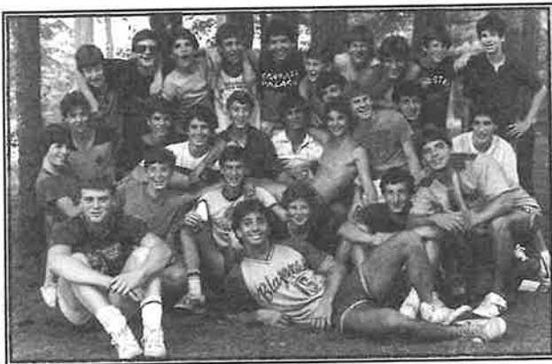
1984 Bunk 14 Then...