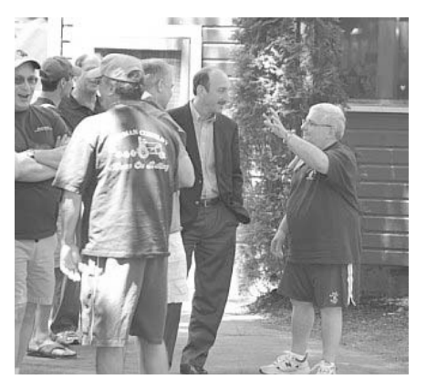
Canteen bills may be paid at the lodge.