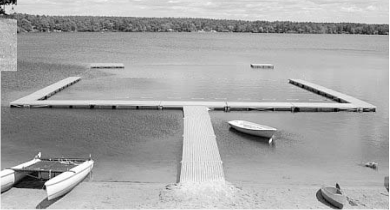
Avoda is a state of mind. Will you be there next year?