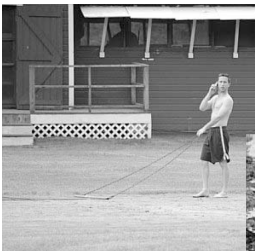
The Grounds Crew Prepares