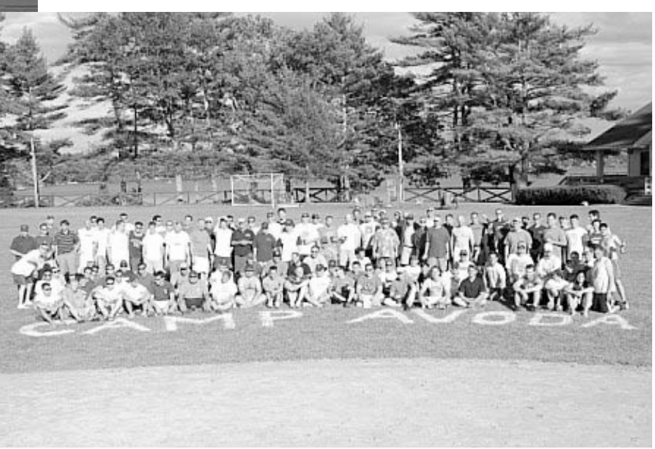
From Left to Right...well...everyone.