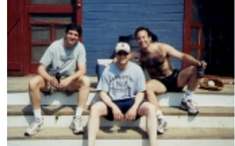
What, who, and how