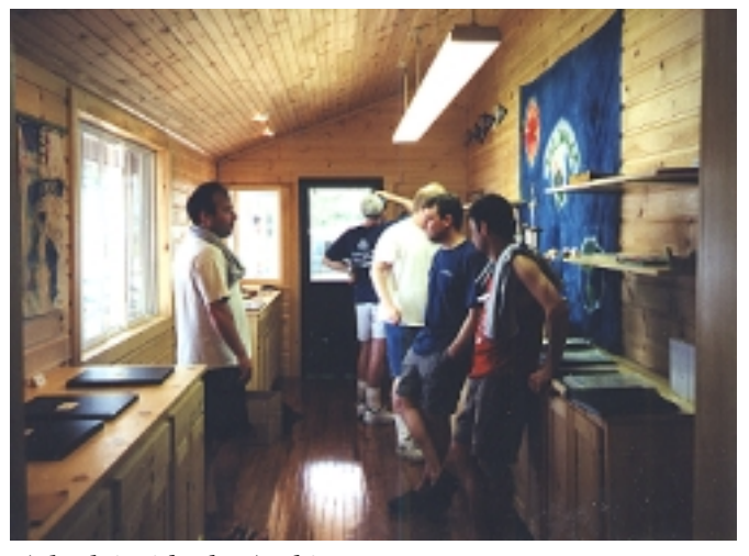
A look inside the Archives